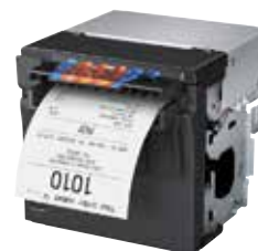
Shown with bezel (optional sold separately)

Paper-saving functions — reduce paper usage by up to 30% 2