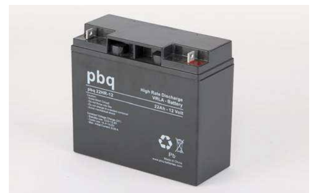
pbq 22HR-12 High Rate Discharge version of the popular 18Ah VRLA battery. More power for your UPS systems without the need of extra shelves or cabinets.