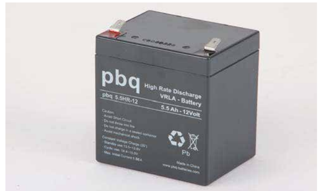
pbq 5.5HR-12 Ideal substitute for wet starter batteries in scooters. Also frequently used for robotics and other high current applications.