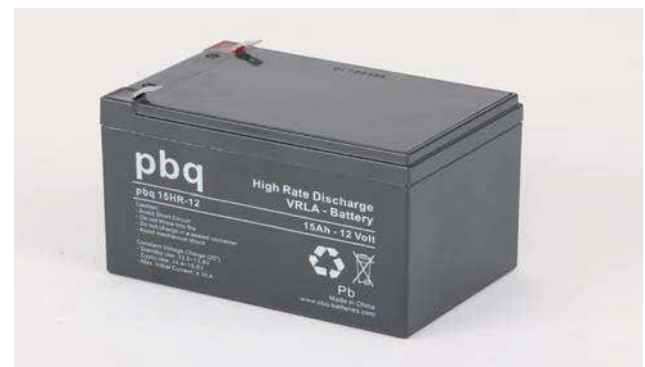
pbq 15HR-12 High Rate Discharge version of the popular 12Ah VRLA battery. Electric bikes, scooters and UPS systems run 25% longer compared to a standard 12Ah.