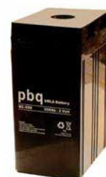
pbq SC-500, 2Volt - 500Ah with cover installed.