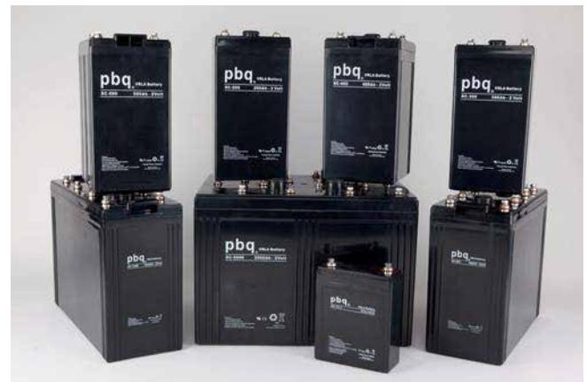
The SC family.