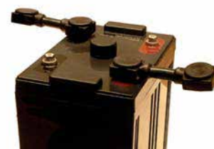
Interconnectors are supplied with all cells.