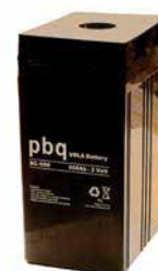
pbq SC-500, 2Volt - 500Ah with cover installed.