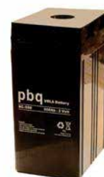
pbq SC-500, 2Volt - 500Ah with cover installed.