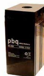
pbq SC-500, 2Volt - 500Ah with cover installed.