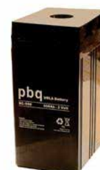
pbq SC-500, 2Volt - 500Ah with cover installed.