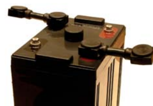
Interconnectors are supplied with all cells.