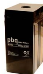
pbq SC-500, 2Volt - 500Ah with cover installed.