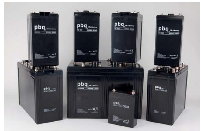
The SC family.