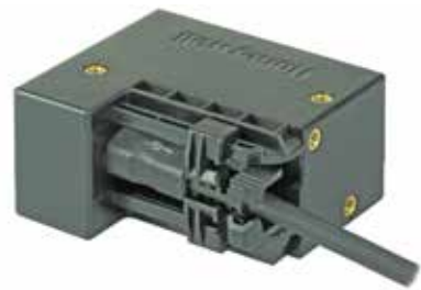
Figure 3. Ten mounting holes on five of six sides