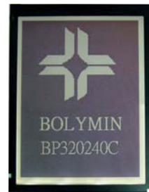
(Options : Frame without ears)