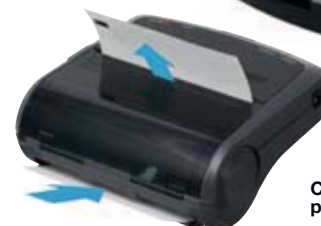
Cut Sheet Paper printing